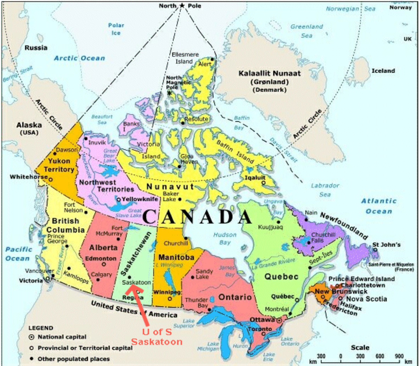
Map of Canada

The University of Saskatchewan is located in the City of Saskatoon, in the Province of Saskatchewan, Canada. Saskatoon is in central Saskatchewan, 52 degrees 07 minutes latitude, 106 degrees 38 minutes longitude. We are in the Central Standard Time zone (GMT -6) year round and, as such, do not adhere to Daylight Savings time.