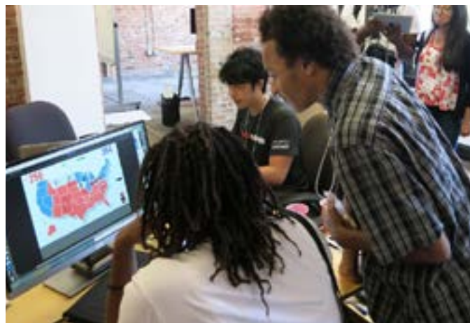
Students test games at White House Education Game Jam

Depending on what your app or tool does, you will need to determine the best way to measure effectiveness. If you are trying to improve learning in academic subjects, in addition to demonstrating that you are aligned with relevant college and career ready standards, the tests, quizzes, and checks for understanding you provide must be validated against the measures educators care about: their own classroom assessments as well as standardized tests. If you are looking to support non-cognitive factors such as grit, persistence, and