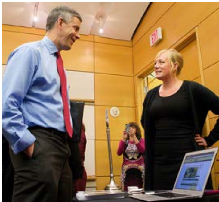
Education Secretary Arne Duncan visits with app developers at an Education Datapalooza