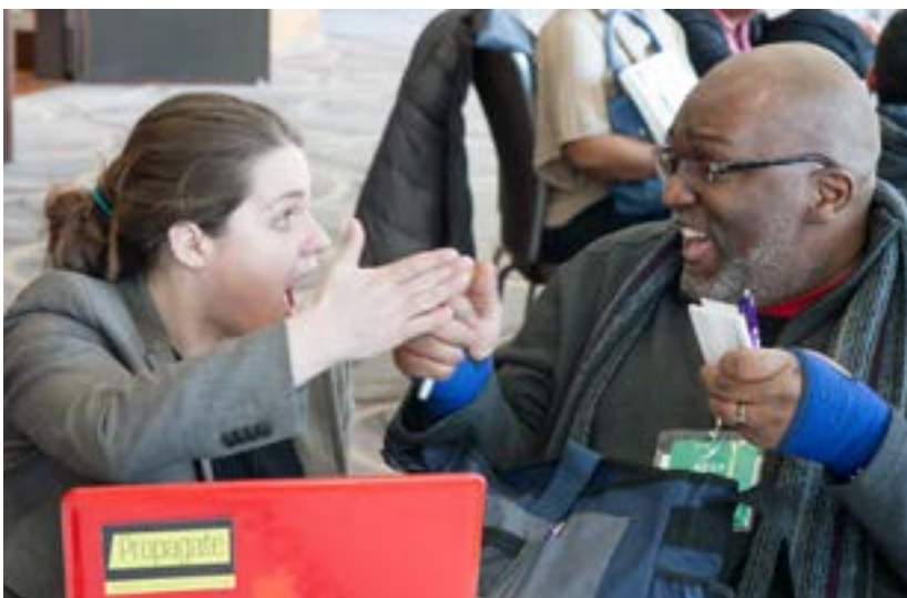
Teacher provides feedback to an entrepreneur at an ed tech summit in Baltimore

Random assignment to create the comparison groups is the preferred approach but is not always feasible, so other matching techniques are often used. It is important to understand and acknowledge their limitations when making claims about the impact or effectiveness of your app or tool.