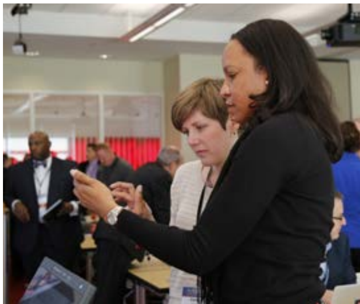
District leaders learn from each other at the Future Ready Summit in Raleigh, NC

Not every teacher will be an early adopter, and not every teacher will pick up your product with a curious willingness to play and see what it can do. No matter what you build, plan an accompanying professional learning component that outlines the basic structures, functions, and abilities of your tool. An online training module, space for a community of users to collaborate, or co-created collection of suggestions will help more reticent users start to feel at home with