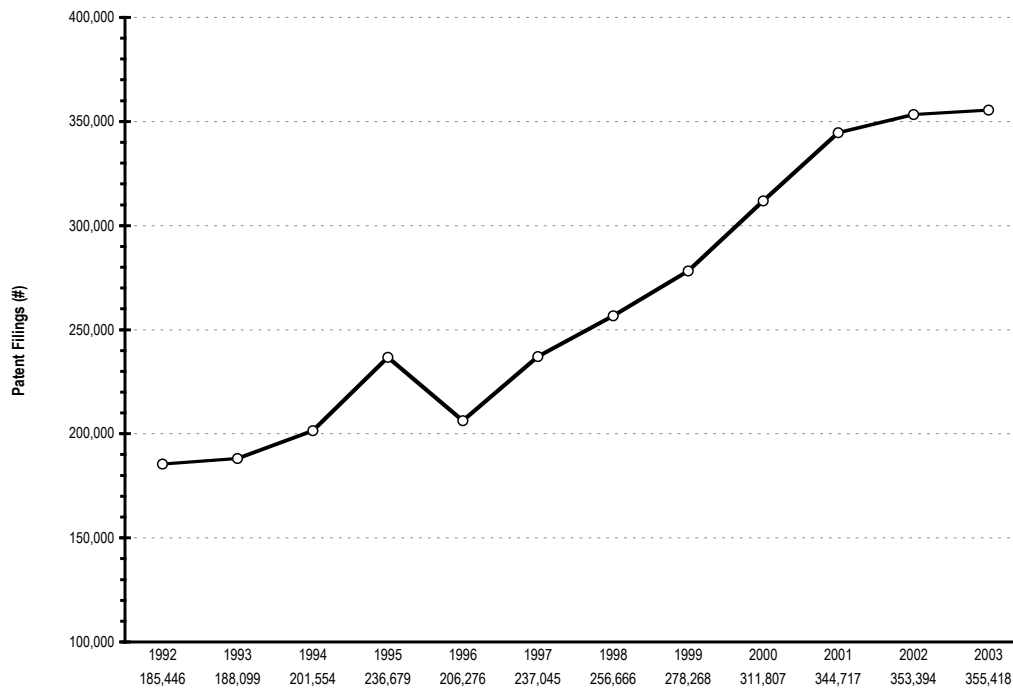
Figure 1: The Recent Rise in Patent Filings 63

corporations that are supposed to be patent pundits. 61 Finally, it is apparent that corporations, such as IBM, pride themselves on the number of patents they have been able to secure and emphasize the attainment of new patents in press releases and correspondence to shareholders. 62