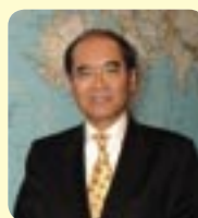
Koichiro Matsuura of Japan was elected Director-General in 1999.