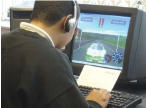
Racing Academy trials

Reflection Players' ability to reflect on what they have achieved through gaming also need further investigation. Much learning theory holds that students should perform an activity, then abstract from it to explain what it is they have learned. Playing a game does not support this process. Should it? Should players have to have developed quite specific ideas about what they have learned from a part of a game before they are allowed to progress further? Or do games support quite different forms of knowledge and skills acquisition? Is learning through games a holistic rather than serial experience? The goals of the individual teacher and school will dictate the extent to which these questions of assessment inform the selection of a game.