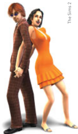
The Sims 2

Similarly, concerns over children developing repetitive strain injury from playing games should be noted, although the evidence to support this claim is very difficult to find. The aggressive behaviour debate also continues. Some research is now beginning to use sophisticated analytical techniques to ascertain whether particular types of players may be more susceptible to aggressive arousal from playing games leading to actual aggression than others 19 , instead of totalising all players as violent games-crazed public threats. And furthermore, of course, all young people need a balance between actual experiences and encounters in their social and cultural worlds and in the virtual worlds of their computer games.