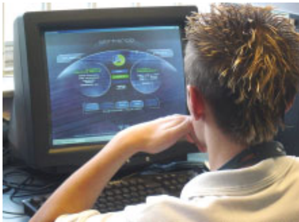
Racing Academy trials