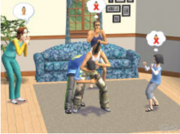
The Sims 2